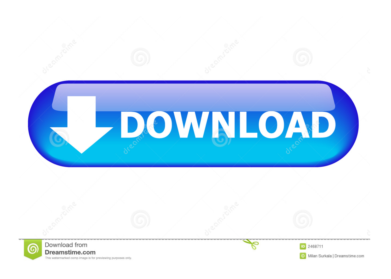
Windows 7 32 Bit Loader Download